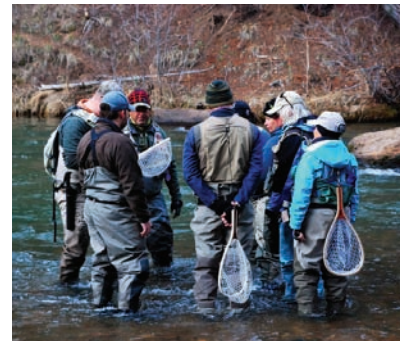
Fly fishing school outing to Pine.